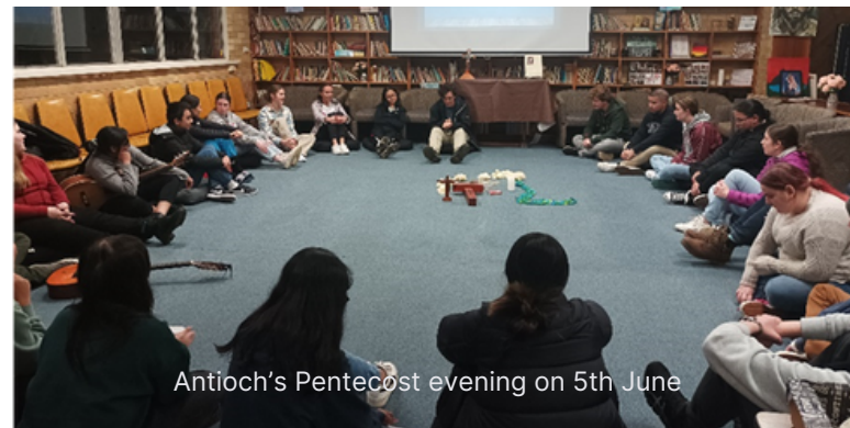
Antioch's Pentecost evening on 5th June