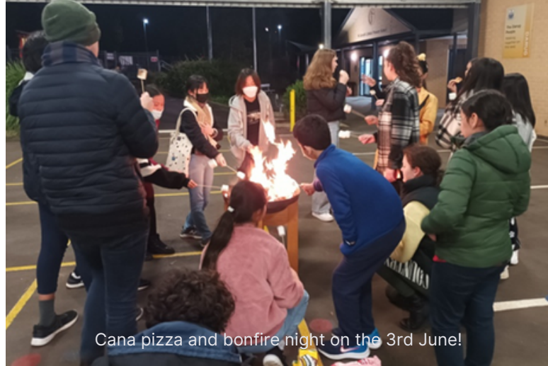
Cana pizza and bonfire night on the 3rd June!

Cana (Year 6-9) - Cana youth group is on Fridays! Cana will have a meeting on 10th June and 17th June at St Gerard's Parish Hall! 543 North Rocks Road, Carlingford - entrance via North Rocks Rd.